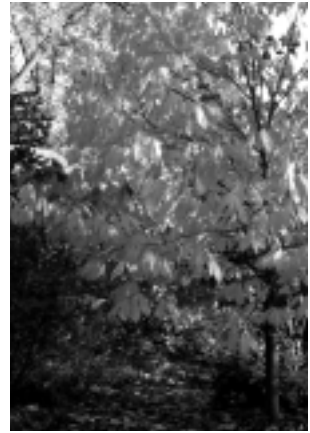
Street trees in the City of Falls Church, planted by the Neighborhood Tree Program since 2000